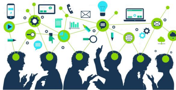
1 - Let's find out more about one of our ASPC members: