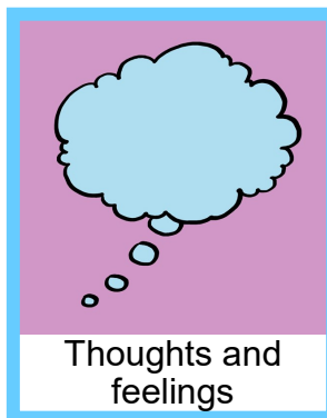
Thoughts and feelings

The Keeping Safe resource gives people an opportunity to reflect on how their lives are going; It supports safeguarding by allowing issues of concern to arise through this supported conversation .